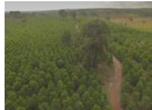
Planted Landscape (Eucalyptus)