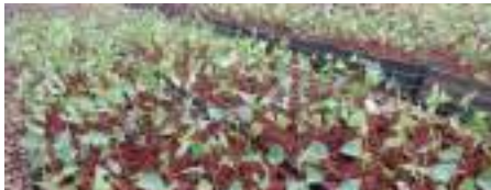
Clonal Seedling Production