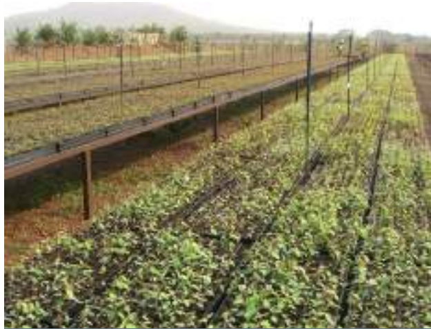
Nursery, Hardening-Out Area