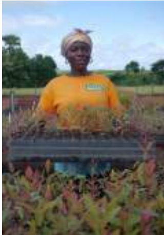
Nursery Team Member