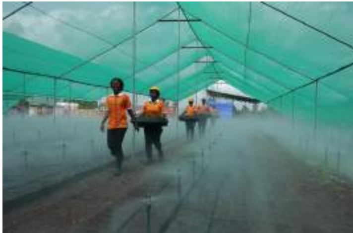
Nursery, Germination Area