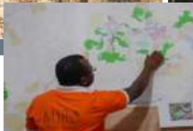
GIS Map Planning