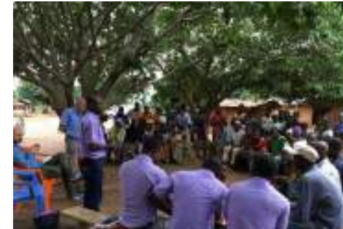
Community Stakeholder Meeting