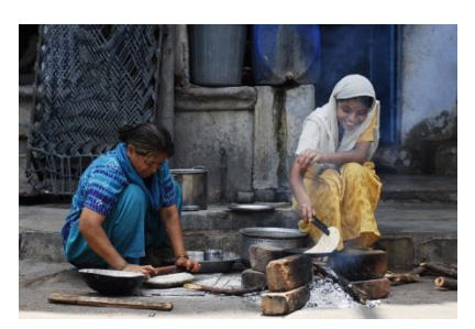
Women cooking on open fire