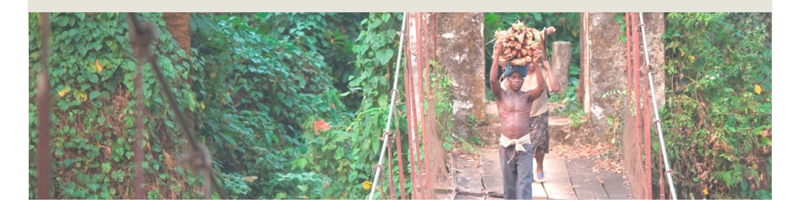
No. 1, November 22, 2018