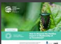
White Paper 6 How to Measure the Positive Impact on Biodiversity of an Investment?