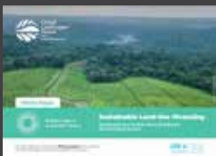
White Paper 3 Sustainable Land-Use Financing