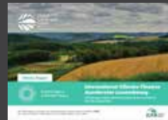
White Paper 7 International Climate Finance Accelerator Luxembourg