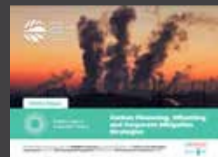
White Paper 9 Carbon Financing, Offsetting and Corporate Mitigation Strategies