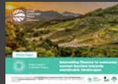
White Paper 8 Innovating Finance to Overcome Current Barriers Towards Sustainable Landscapes