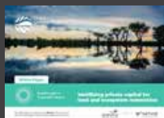
White Paper 5 Mobilising Private Capital for Land and Restoration Ecosystem