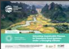
White Paper 2 Unlocking Sustainable Finance to Transform Food Systems under a Changing Climate