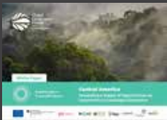
White Paper 1 Central America