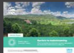
White Paper 10 Barriers to Mainstreaming