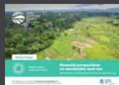
White Paper 11 Financial Perspectives on Sustainable Land Use