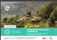
White Paper 4 Powering the Indonesian Archipelago